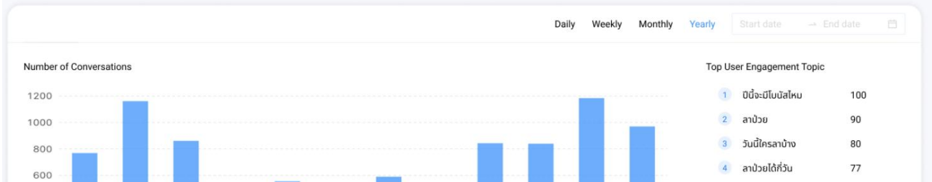
Real-time activity dashboard

Multi-agent Framework: support custom AI agents for various use cases across the organization such as: